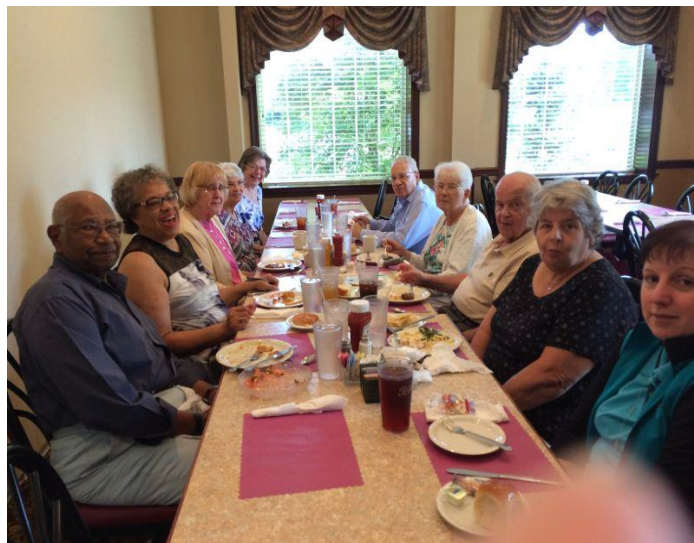
Our PrimeTimers enjoy a meal at the Dutchway Buffet in Lancaster, Pa.